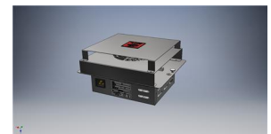
Sahara Fan Model SF309

Dimensions Width - 1814mm Depth - 680mm Height - 900mm Weight - 137kg