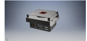
Sahara Fan Model SF309

Dimensions Width - 1814mm Depth - 680mm Height - 900mm Weight - 137kg