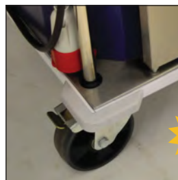
Heavy Duty bumpers