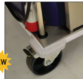
Heavy Duty bumpers