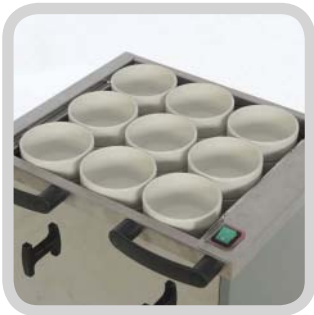
UHD1 - shown with cups