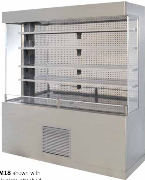
MM18 shown with kick plate attached