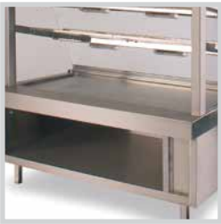
Rear view of BK9A

Modular ambient units designed to complement the hot and cold displays. These rigidly constructed units can be used to display a wide variety of food products. Solid stainless steel bottom shelf with perforated top and mid shelves. Food display is enhanced with internal illumination. Forward tilting front glass panel for easy cleaning. Open undershelf to rear. Optional front of shelf name or price tag holders.