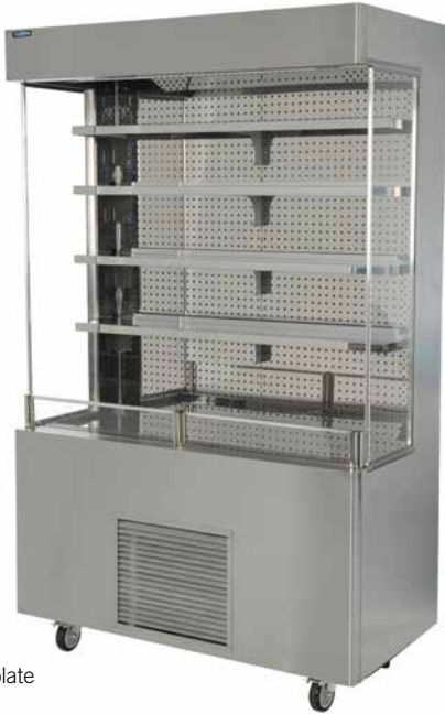
MM12 shown without kick plate

The merchandiser has a refrigerated well with recirculating cold air which cascades down the front and over the shelves to ensure even temperatures of 2°C-8°C. The compact unit makes maximum use of space to display large quantities of chilled food and drinks in a self-service environment. Ticket holders for front of shelf and night blind are available. Please note if these units are to be used for overnight storage it is essential that a night blind is fitted, failure to do this may invalidate the warranty.