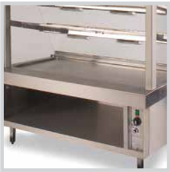
Rear view of BK9H