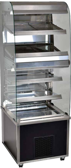
MHC1 Heated and chilled