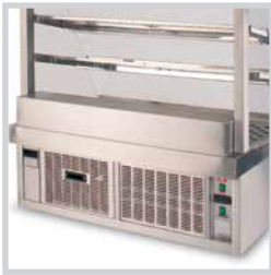
Rear view of BK9R

Stylish modular units display hot food with maximum impact. Bottom shelf inset with toughened highly efficient thermo panels with built in heating elements ensuring evenly distributed heat over the full area. Quartz heated and illuminated top and mid shelves. Forward tilting front glass panel for easy cleaning. Optional front of shelf name or price tag holders. Open undershelf to rear.